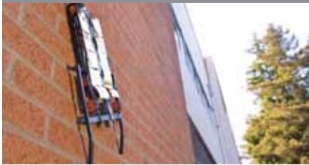
SRI's electroadhesive wall-climbing robot