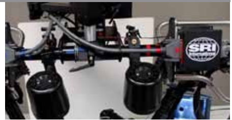
Robotic arms in a modular surgical platform

“SRI is a world-class innovation center, creating industry-leading ventures that continue to change the world. Their disciplined innovation process for creating ventures is unparalleled. They are an outstanding partner, and we are proud to work with them. Our doors are always open to SRI.”