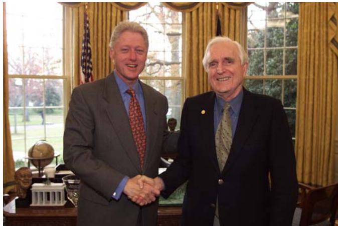
In 2000, President Clinton presented Engelbart with the prestigious National Medal of Technology.