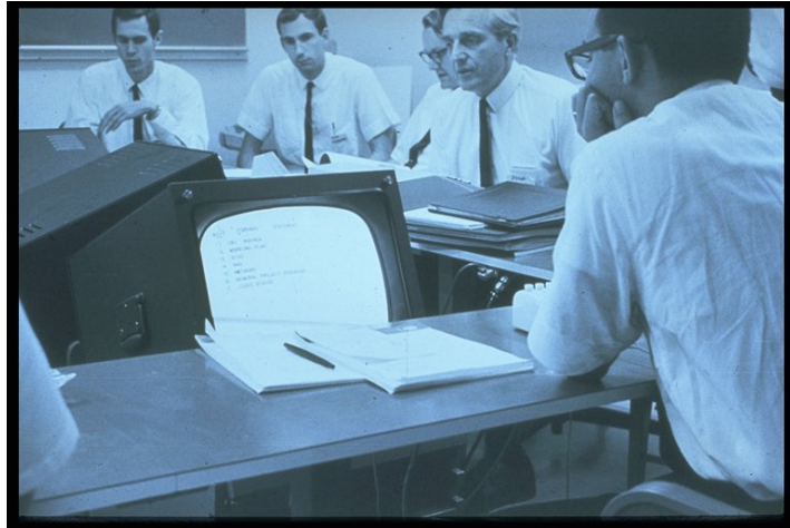
Engelbart and his team at the Augmentation Research Center use an early collaborative computing system during the late 1960s.