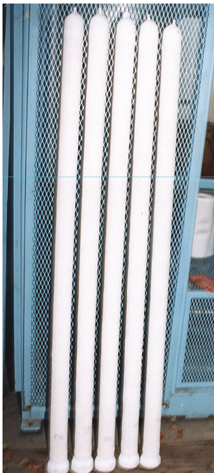
1.5m long candle filters developed by 3M

Applications for large-size and large-volume composites are emerging in the aerospace, windpower (turbine blades and poles), and automotive markets. To support evolving needs of these sectors, demand for fiber-reinforced composites is growing rapidly, while advanced technologies are being developed that require lighter and tougher materials.